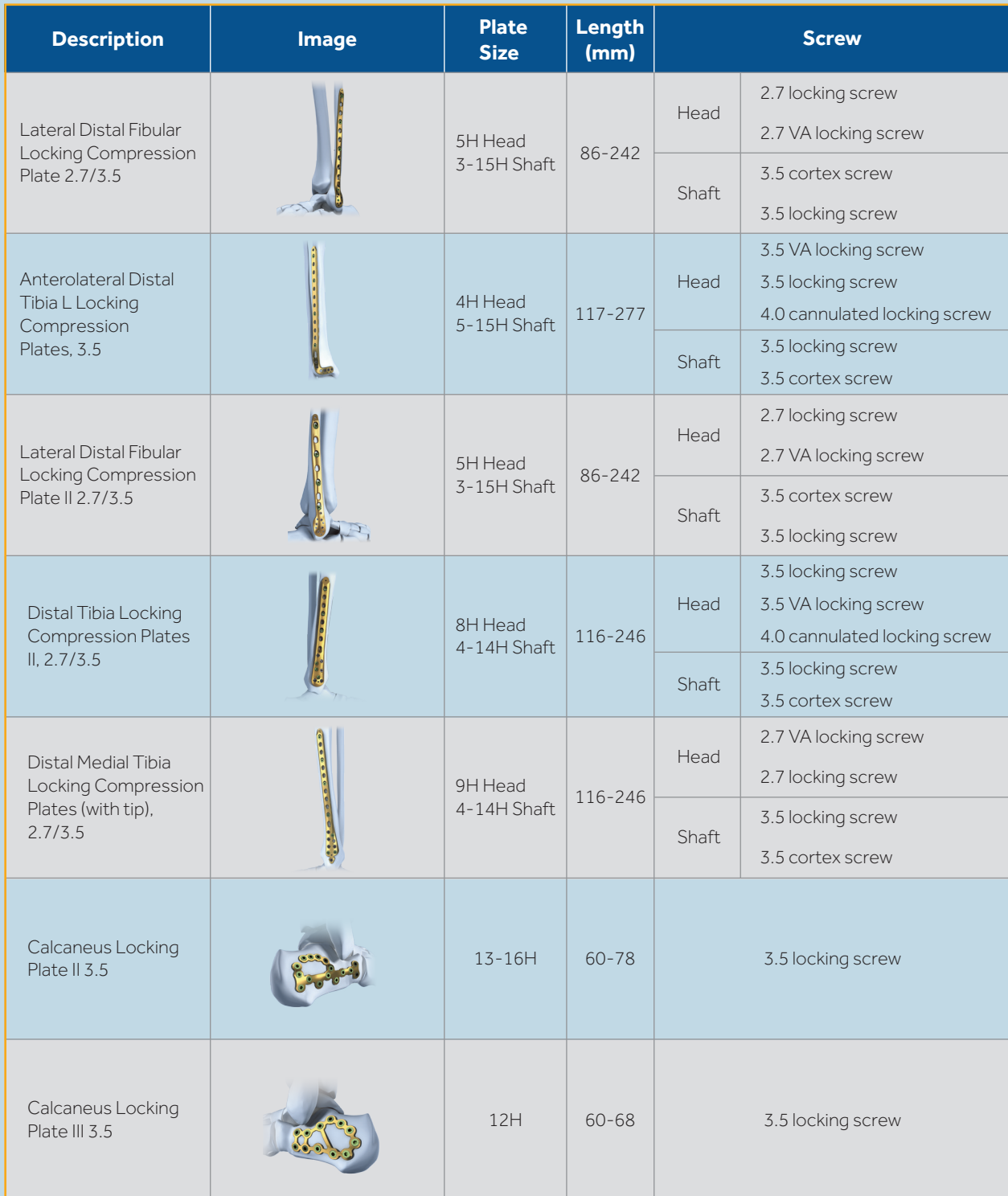
PLATE AND SCREW OPTIONS