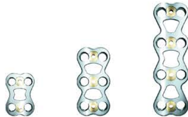
One-level Plate Two-level Plate Three-level plate