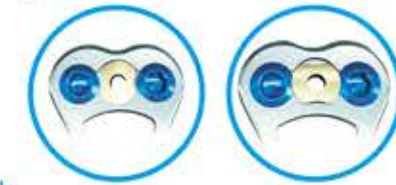
Midline Alignment Notch